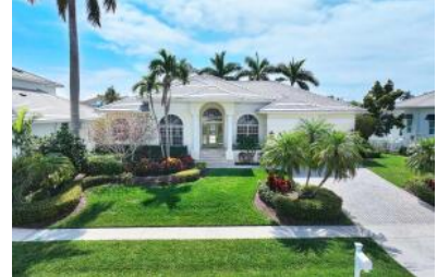
471 RENARD COURT, Marco Island, FL 34145

Community: Marco Island Unit: 12 Bedrooms Total: 3 A/C SqFt: 2,236 Furnished: Unfurnished Garage Spaces: 2 Guest House Y/N: No View: Bay, Intersecting Canals; Long Water; Pool Pool Private Y/N: Yes Spa Y/N: Yes Subarea Type: Water Direct Block: 376 Bathrooms Full: 2 Total Area-SqFt: 2,690 Stories: 1 Rear Exposure: South Carport Spaces: 0 Boat Dock: Yes Architectural Style: Coastal; Ranch Roof: Tile Land Value Y/N: No Water Front Footage: 100 Road Frontage Length: 100 Lot Size Dimensions: 100X110X100X110 Parcel Number: 58041000008 Lot: 9 Bathrooms Half: 0 Meas. for A/C: Property Appraiser Office # Office Den: 1 Year Built: 1996 Island Location: Hideaway Beach Flood Plain: Yes Vehicle Restriction Y/N: No Boat Lift: Yes Acres: 0.25