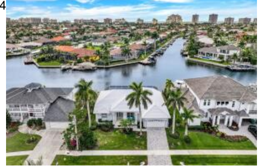
1159 WHITEHEART COURT, Marco Island, FL 34145

Community: Marco Island Unit: 7 Bedrooms Total: 3 A/C SqFt: 2,200 Furnished: Furnished Garage Spaces: 2 Guest House Y/N: No View: Canal; Intersecting Canals; Long Water; Wide Water Pool Private Y/N: Yes Spa Y/N: Yes Subarea Type: Water Indirect Block: 207 Bathrooms Full: 2 Total Area-SqFt: 3,898 Stories: 1 Rear Exposure: Southwest Carport Spaces: 0 Boat Dock: No Architectural Style: Coastal; Contemporary Roof: Tile Land Value Y/N: No Water Front Footage: 80 Road Frontage Length: 80 Lot Size Dimensions: 80x110x80x110 Parcel Number: 57672720004 Lot: 33 Bathrooms Half: 1 Meas. for A/C: Property Appraiser Office # Office Den: 1 Year Built: 1994 Island Location: Center Island South Flood Plain: Yes Vehicle Restriction Y/N: No Boat Lift: No Acres: 0.2